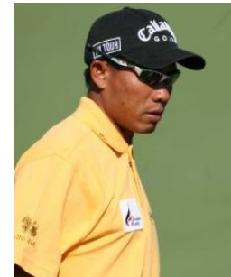
Thongchai Jaidee Thailand